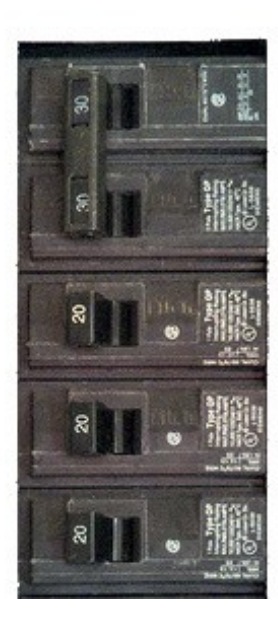
Figure 2. Residential Breaker Box