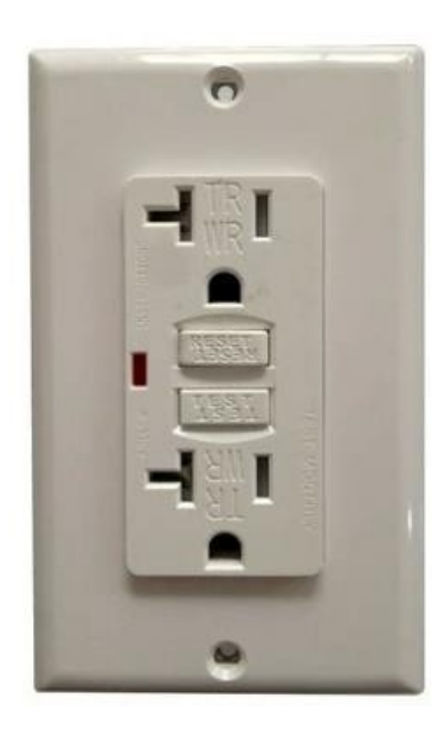
Figure 5. GFI Outlet.

In newer homes, some outlets are protected by a Ground Fault Interrupter (GFI), most often in kitchens, bathrooms, and outside the house. Some, particularly those in kitchens and bathrooms, have a distinctive connector, Figure 5.