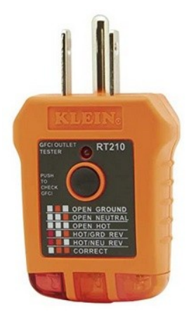
Figure 4. AC Outlet Tester.

You need an adapter between a 3-wire plug and a 2-wire outlet. If you use one, be sure to connect its ground wire to the screw that secures the outlet cover plate<sup>2</sup>. If you have any doubts about your wiring, testers such as the one in Figure 4 are inexpensive insurance. As you can see from its label, the indicator lamp's pattern shows the outlet's state. It's also helpful during the first step of PC troubleshooting, ensuring it has electrical power.