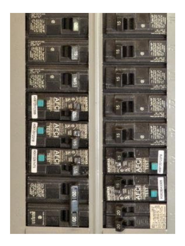
Figure 6. Breaker Box Equipped with GFI Breakers.

Note the green squares labeled "Test" on five of them. These are GFI breakers, but all their outlets are normal, with no test or reset buttons. This is probably because the outlets are near the floor and can be obscured by furniture, making them difficult to access.