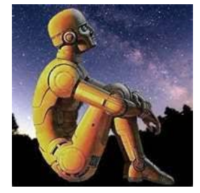
R. Daneel Olivaw

It is challenging to speculate whether technology will ever advance to the point that it is possible to develop a machine so complex that it is for all practical purposes a sentient being. It is a serious scientific debate as to whether such an outcome would benefit or doom humankind. Such a machine could solve problems that have eluded humans, but it could also decide that humans are the problem. SciFi literature is also divided as to whether the end result of sentient machines will be negative ("Battlestar Galactica") or positive (works of Isaac Asimov) for humanity.