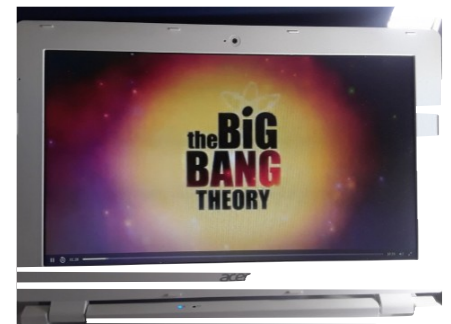
BBT on the Chromebook

Once on the plane, I found Southwest had made some improvements to their in-flight Wi-Fi services. It appears they have now rolled out Wi-Fi to all their planes. On our flight to Nebraska last year, I was not able to access their in-flight TV or movies (even the free ones) on my Chromebook, as they only supported Windows, iOS and Android devices. Now they have added support for the Chrome OS, as I could connect and view free episodes of the Big Bang Theory and other recorded and live TV video. Unfortunately, I forgot to bring headphones, so I had to wait to watch until the return trip, after I'd bought some cheap earbuds.