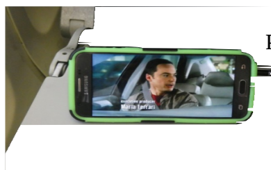
The BBT On-Tray

There are some great Bay Area tech museums, which are worth the visit if you are in the area. The Intel Museum in their Santa Clara headquarters has displays of the evolution of their processor and storage technologies. The Computer History Museum in Mountain View has excellent displays covering computing technology from the abacus to today's modern devices; you can easily spend hours there.